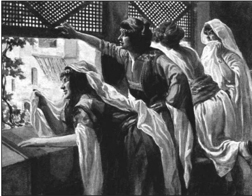
Michael despises David, painting by James Tissot.

David also gave alms to all the poor, and offered up costly sacrifices. His joy was marred, however, when his wife Michal despised him for dancing and singing before the