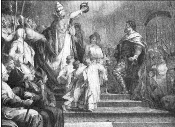
The Coronation of Charlemagne.

The last years of Charlemagne's reign were far more peaceful than the first; still, he